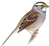
White-throated Sparrow (4)