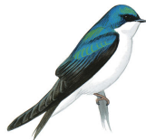
Tree Swallow (3)