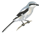
Northern Shrike (2)