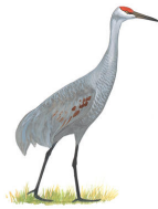
Sandhill Crane (1,073)