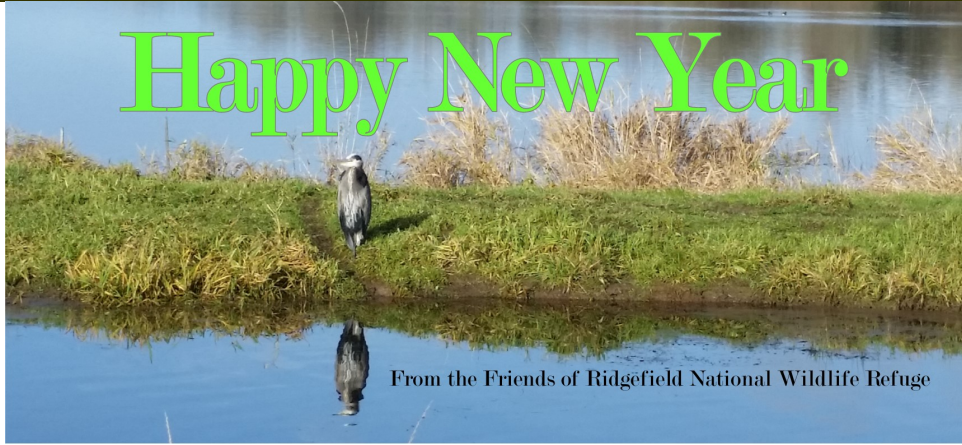
From the Friends of Ridgfield National Wildlife Refuge