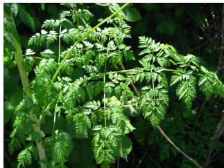
Poison Hemlock Ragwort

We have several older planting sites that still need work so if you would like to come out and help "Free the Trees" with us we will be continuing with this effort on Wednesday volunteer work days throughout December.