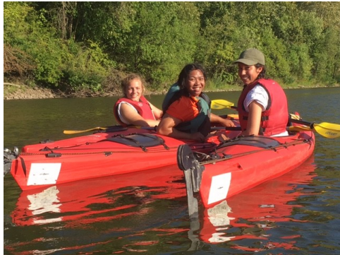
YCC Youth from Ridgefield NMRC enjoyed an appreciation paddle along the waterways between the units of the Refuge.

This land is our land, but what it means to love the outdoors may not be the same for you and me. From Latinos in Lycra, to Korean politicians finding votes on trails, NPR's podcast Code Switch took a look at stereotypes and truths about people of color and their relationships with the outdoors in their episode, " Made for you and Me. " (aired on June 7 th , 2016).