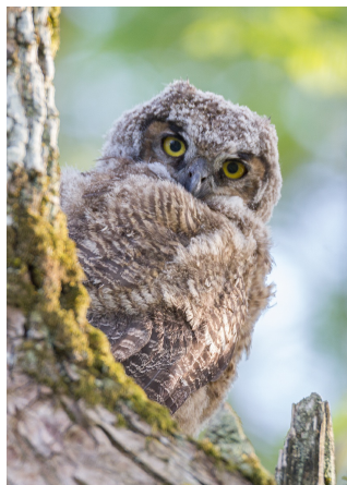
(Baby Great-Horned Owl)

The Oregon-California Trails Association and the Lewis & Clark Trail Heritage Foundation present the 2017: 'Vancouver: Layers of History on the Columbia River