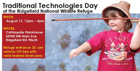
Traditional Technologies Day August 13 12:00-4:00

Come experience a day featuring ancestral skills and indigenous knowledge! Learn how to start a fire from scratch or make a survival bracelet to have on hand for emergencies as well as many other activities!