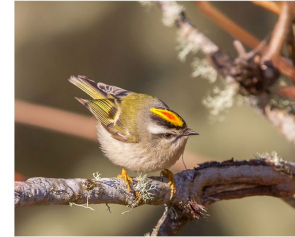
2nd Place Birds Category, 2019 Photo Contest Winner