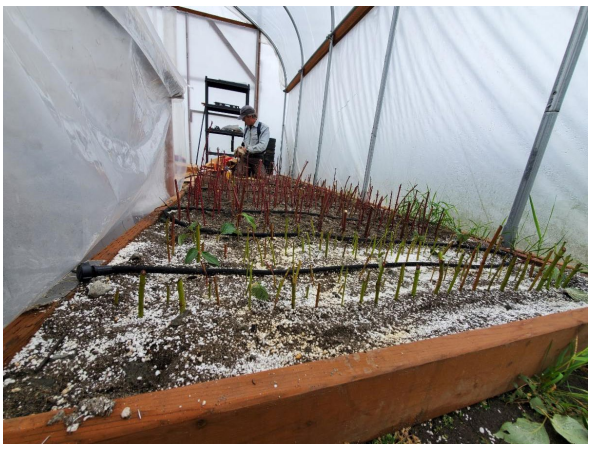
planting maintenance, and Ricefield Bulrush searching.

The Friends are so thankful for our small but dedicated group of volunteers that have been working behind the scenes and on the land! Here are some highlights from the last month.