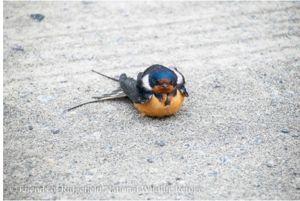
image description: Fledgling Barn Swallow sits on the Auto Tour between flight lessons, June 2022