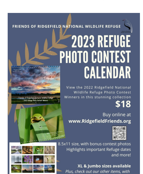
Photo Contest Calendar, BirdFest & Bluegrass button image, and more!

Check out the 2022 Ridgefield National Wildlife Refuge Photo Contest-winning images in this spectacular collection. This 2023 calendar not only features the winning images along with their photographer's name and place, but also includes fun facts about the subjects of each photo, important Refuge-related holidays, and more. Support wildlife, nature, and education with one purchase that keeps on giving.