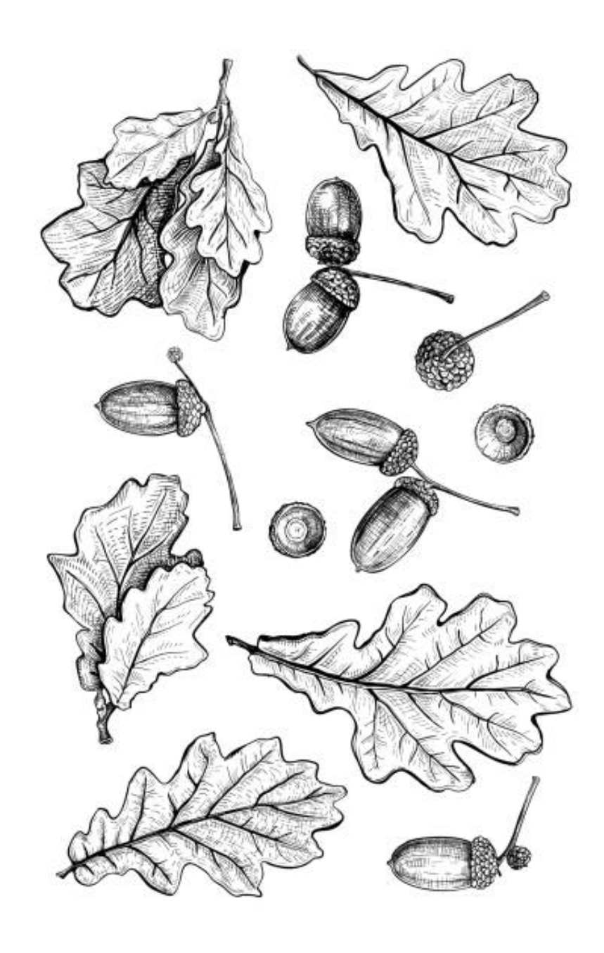
Oregon White Oak