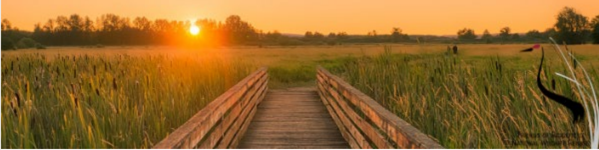
image credit: Oca Hoeflein, 2018, 2nd place Landscape Category, Pro Photo Supply Refuge Photo Contest

Please add contact@ridgefieldfriends.org to your address book or safe senders list. You are receiving this email because you are either a member or signed up for our mailing list.