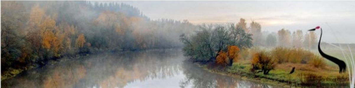
Image credit: Gary Grossman, 2020, Honorable Mention Landscape Category, Pro Photo Supply Refuge Photo Contest

Please add contact@ridgefieldfriends.org to your address book or safe senders list. You are receiving this email because you are either a member or signed up for our mailing list.