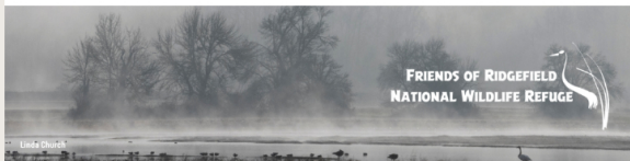
Image credit: Linda Church, 2023, Honorable Mention Landscape Category, Pro Photo Supply Refuge Photo Contest

You are receiving this email because you are either a member or signed up for our mailing list.